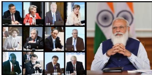
Prime Minister of India Narendra Modi at the G7 meeting (virtual)